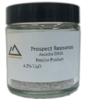
Source: Prospect Resources, Arcadia Lithium Project site and Petalite samples